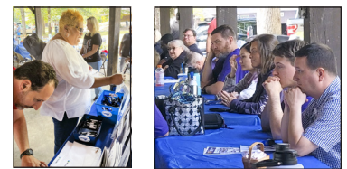
SEANC's western districts sponsored the Western Region Juvenile Justice Appreciation Event on Sept. 21. The districts provided hot dogs and hamburgers for all employees for lunch and recruited 12 new members!