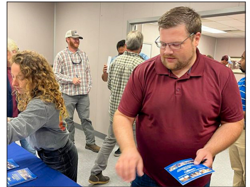
District 62 provided lunch for employees at the Department of Environmental Quality office in Wilmington on Nov. 1.