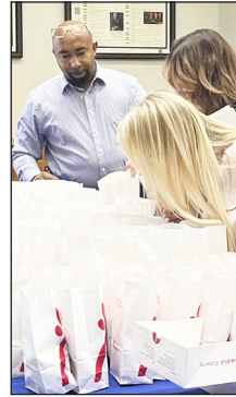
District 17 members provided an appreciation lunch on Nov. 14 for Guilford County Courthouse employees.