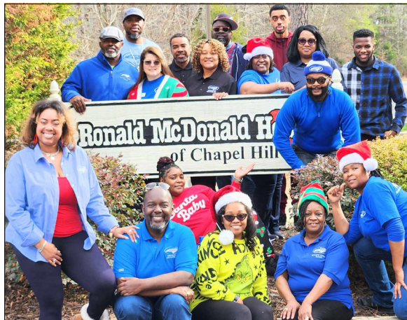
Emerging Leaders volunteered at SECU Family House and Ronald McDonald House in Chapel Hill on Dec. 9. They folded clothes, baked cookies and spread holiday cheer.