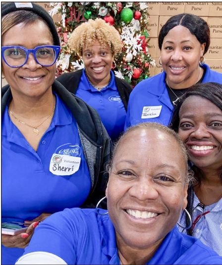
District 12 members volunteered at Samaritan's Purse on Dec. 13. The district also gifted Common Heart and a private citizen a token of holiday cheer! Common Heart is an agency in Union County that aids in feeding families all year long.