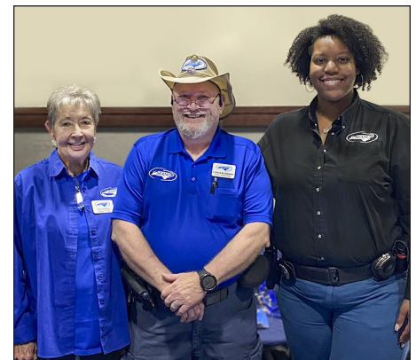
District 2 members visited Haywood County agencies in November.