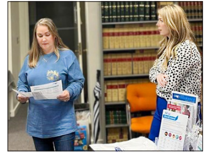
District 61 held an appreciation event for employees at Duplin County Courthouse, Community Supervision, and N.C. Works offices on Oct. 14.