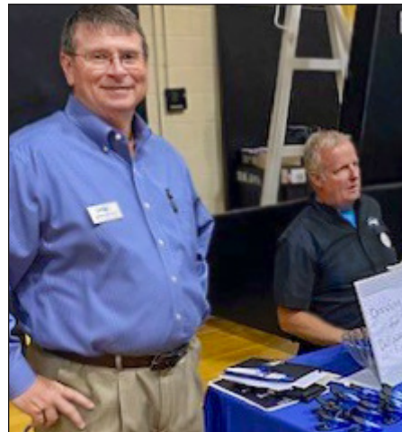
SEANC attended the Appalachian State Health Fair on Oct. 6.