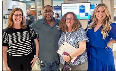
District 25 members attended festivities at UNC Chapel Hill for International Executive Housekeepers Association Week in September.