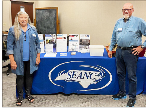
District 62 visited employees at the Brunswick County Courthouse and Community Supervision on Oct. 26.