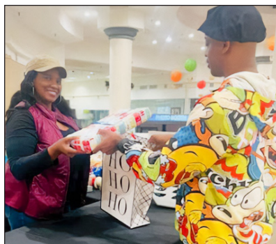
District 65 blessed four children from Pitt County's Salvation Army's Angel Tree. In addition, they donated Coats for Kids, helped families in the local women and children's program and wrapped gifts at Greenville Mall.