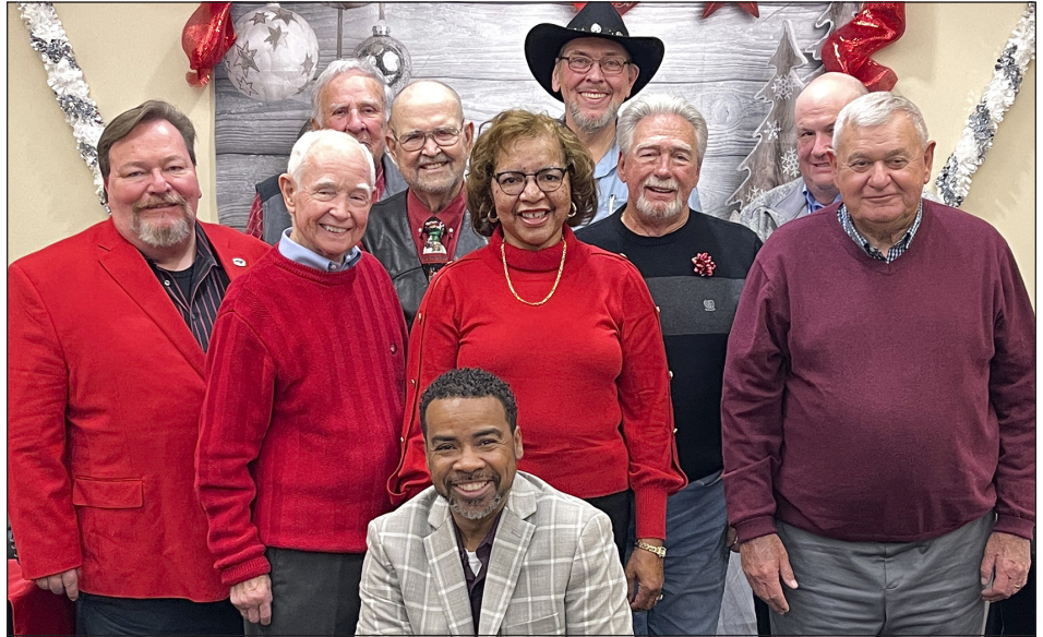
SEANC's past presidents and their spouses gathered on Dec. 8 at the Central Office for a holiday luncheon in their honor! We're thankful for their wealth of knowledge about state government and the association.