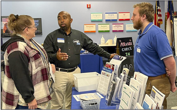
District 42 members visited the Disability Determination Services offices in Raleigh on Nov. 2.