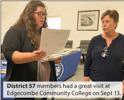
District 57 members had a great visit at Edgecombe Community College on Sept 13.