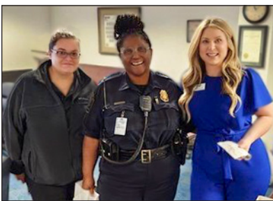
District 44 members sponsored lunch for the State Capitol Police on Sept. 28 in appreciation for their hard work.