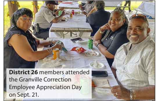
District 26 members attended the Granville Correction Employee Appreciation Day on Sept. 21.