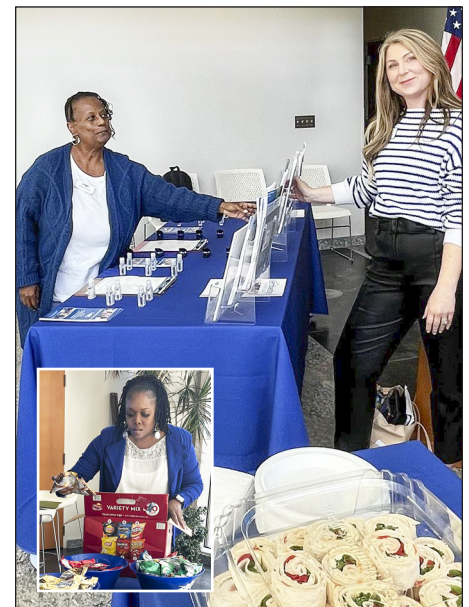
District 38 provided lunch on Oct. 26 for the Department of Environmental Quality employees at the Raleigh office in appreciation for their hard work!