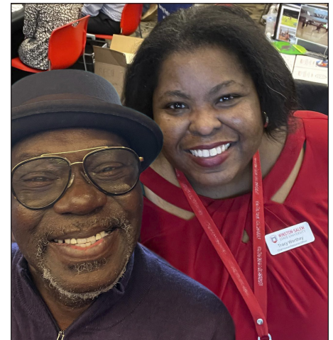
District 16 members attended the Winston-Salem State University Benefits Fair on Oct. 4.