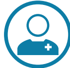
Personal Care Assistance