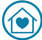
Home Health Care