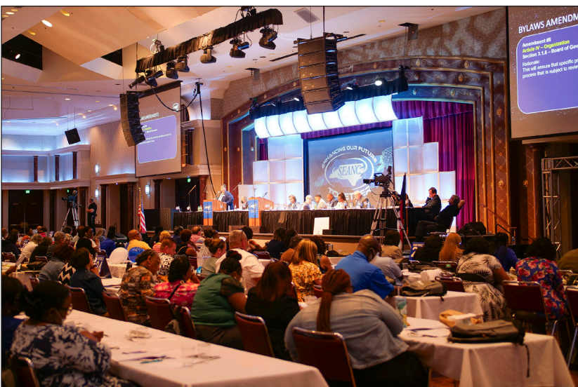
Delegates voting on one of the 83 bylaws amendments.