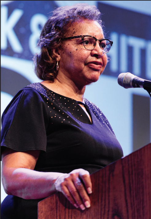
President Fowler welcomes delegates and guests to the 2023 Black & White Ball.