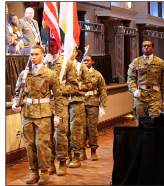
Presentation of Colors by the NC A&T State Color Guard.