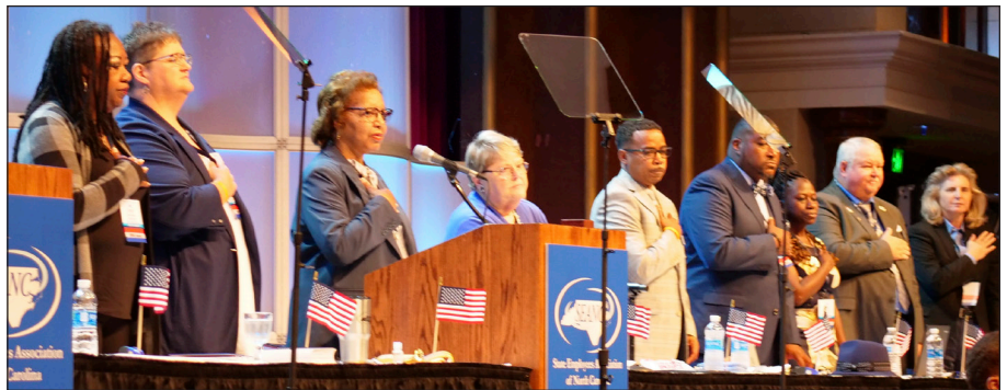
Statewide officers and parliamentarians stand for the Pledge of Allegiance.