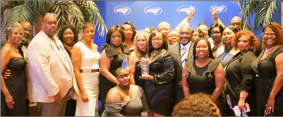
District 22 received the 2022-2023 District of the Year Award in recognition of outstanding membership involvement in advancing the goals of the association within the year.