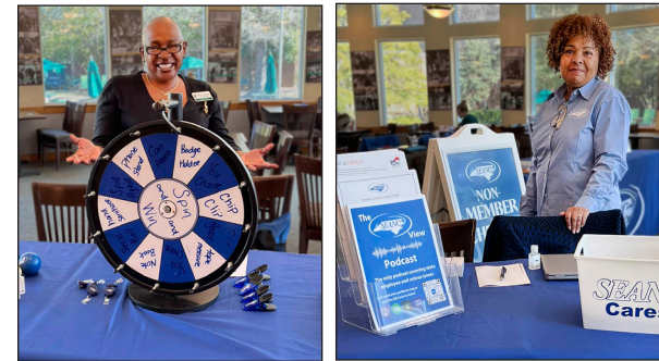
District 13 sponsored an employee appreciation event at UNC Charlotte on Feb. 7. Twenty five employees joined SEANC that day!