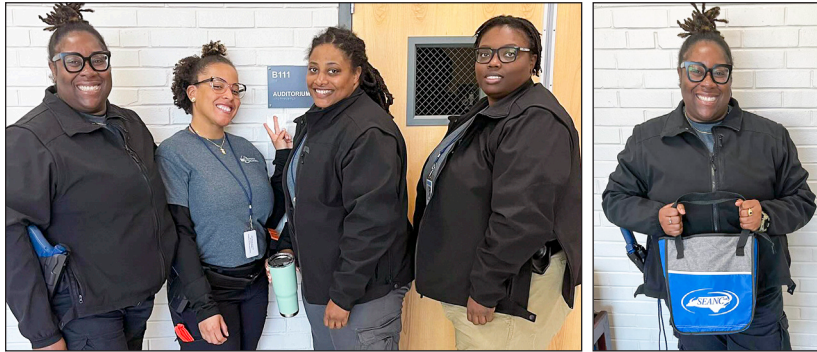
District 20 visited probation and parole employees at Samarcand Training Academy in February. Employees who joined SEANC received a lunch bag.