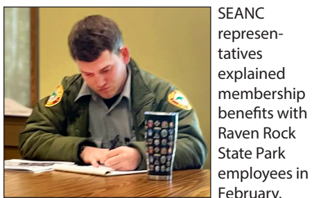
SEANC representatives explained membership benefits with Raven Rock State Park employees in February.