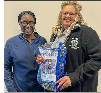
District 12 visited the Huntersville DMV Call Center employees in February.