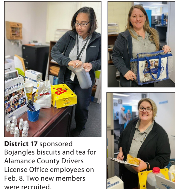
District 17 sponsored Bojangles biscuits and tea for Alamance County Drivers License Office employees on Feb. 8. Two new members were recruited.