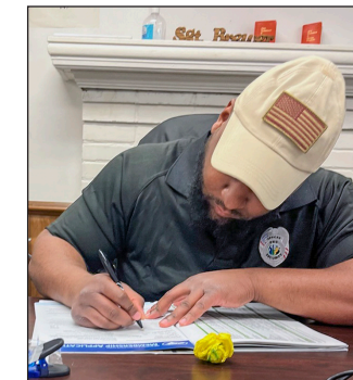
District 22 attended the Harnett Correctional Institution New Employee Orientation on Jan. 31. Two employees joined SEANC.