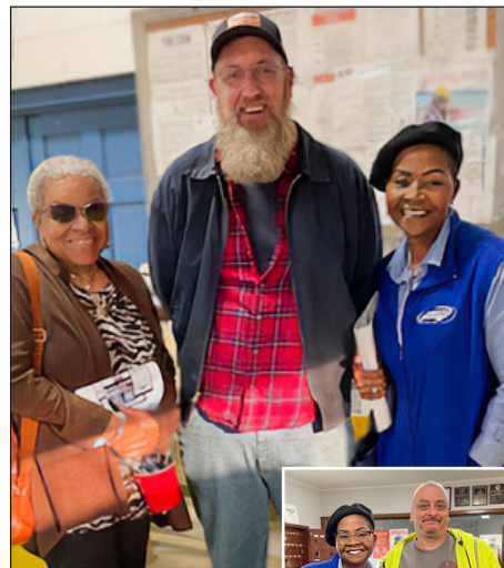
District 18 provided a McDonald's breakfast for employees during the Montgomery County DOT Safety Meeting in March.