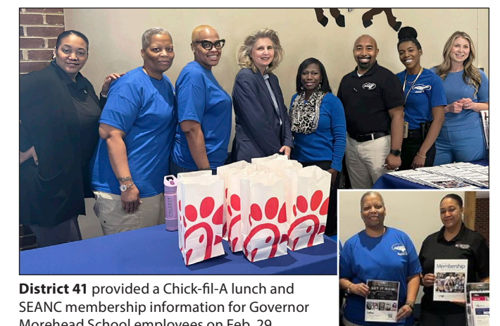
District 41 provided a Chick-fil-A lunch and SEANC membership information for Governor Morehead School employees on Feb. 29.