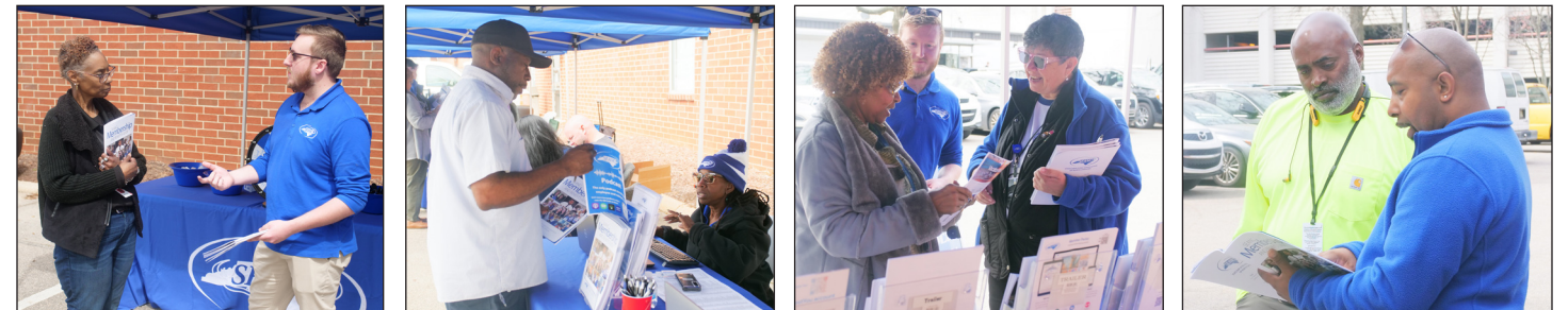
Department of Administration Facilities Division • March 22