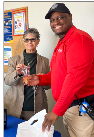
District 24 visited Robeson County Community Correction and the CRV Center on Feb. 12.