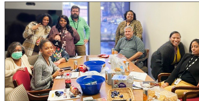
District 17 hosted a Snack & Chat event with Guilford County Juvenile Justice employees in January.