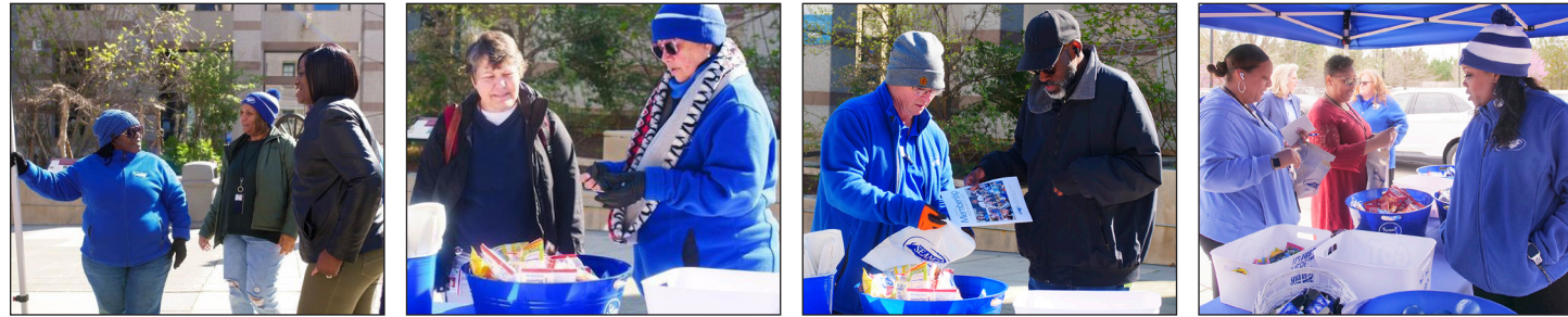
Bicentennial Plaza • March 19