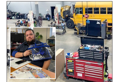
District 17 sponsored a Bojangles breakfast for Alamance County Schools mechanics and staff on Feb. 26 and recruited two new members!