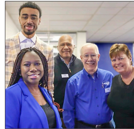
District 69 attended the Elizabeth City State University Employee Orientation in January and recruited two new members!