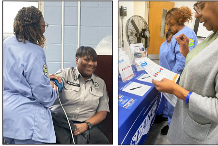
District 40 shared SEANC membership benefits with employees during N.C. Corrections Health Event held at NCCIW in January.