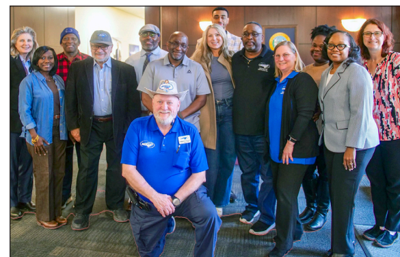
The State Membership Committee met on Feb. 9 to discuss membership growth, recruitment, and engagement ahead of the February Board of Governors Meeting.