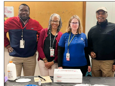
District 37 sponsored coffee and donuts for North Carolina Department of Transportation Century Center employees on Feb. 20.