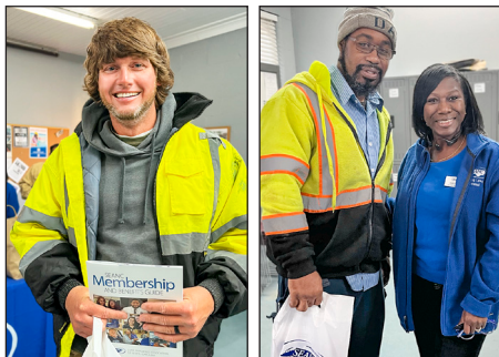
District 23 members had a great day at Robeson North Carolina Department of Transportation safety meeting on Feb. 15. Two new members joined. Thank you to the McDonald's in Lumberton for serving up 50 biscuits for us!