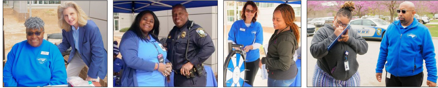
State Laboratory of Public Health • March 18

Wake County has the largest concentration of state employees and retirees in the state, and we visited enthusiastic employees at the Department of Health & Human Services, the Department of Insurance, the Governor's Crime Commission, Central Prison, and Wake Correctional, among others.