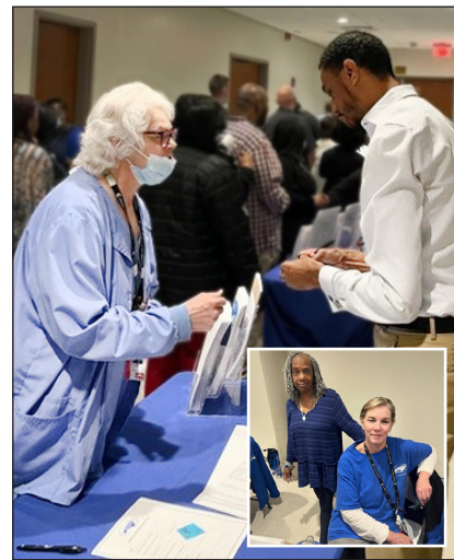
District 59 sponsored an employee appreciation event at Cherry Hospital in Goldsboro on March 27. Complimentary meals were provided for staff during all three shifts. They signed up 51 new members!